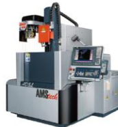
AD5L AMS高速深孔加工機 AMS High Speed Small Hole Drilling EDM