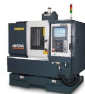
HM4030L 龍門型線馬驅動 三軸高速加工機 3-Axis Linear Motor Drive High Speed Milling Machine

慶鴻機電工業股份有限公司 CHING HUNG MACHINERY & ELECTRIC INDUSTRIAL CO., LTD.