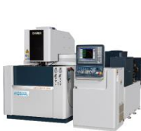
RQ530L 龍門型線馬驅動線切割機 Gantry Type Linear Drive Wire Cut EDM