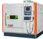
PL6880 高精密磁浮雷射切割機 High Precision Linear Drive Laser Cutting Machine